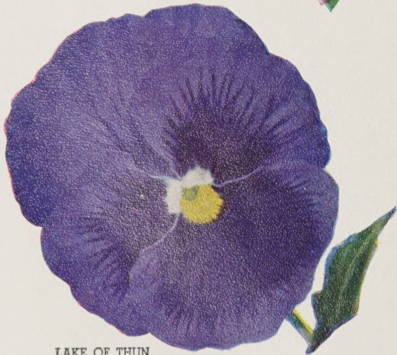
LAKE OF THUN